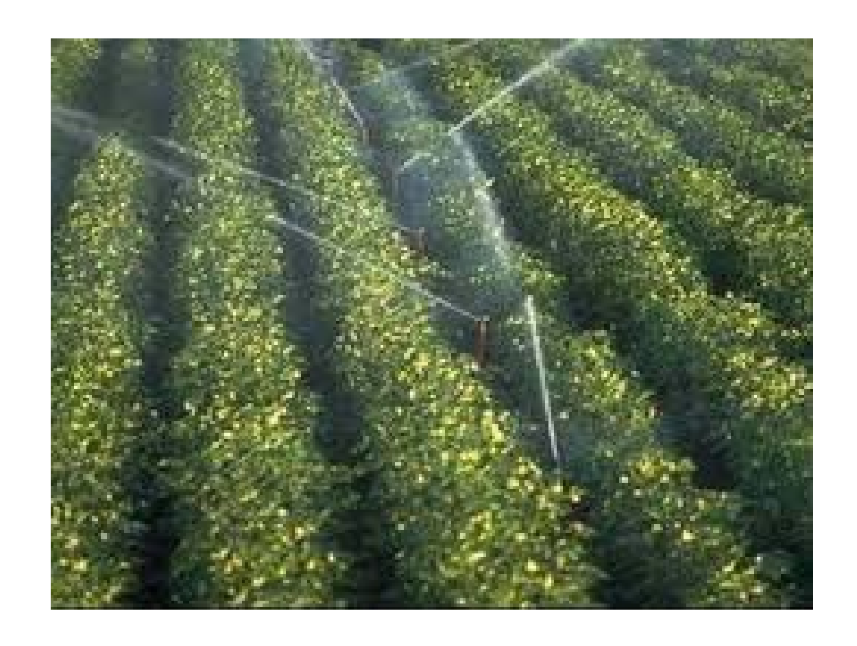
Government of India Ministry of Water Resources, River Development & Ganga Rejuvenation